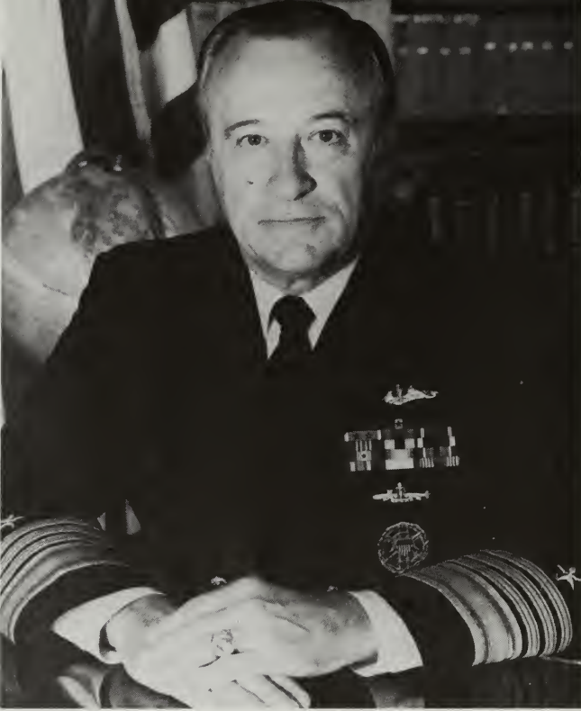
Chief of Naval Operations